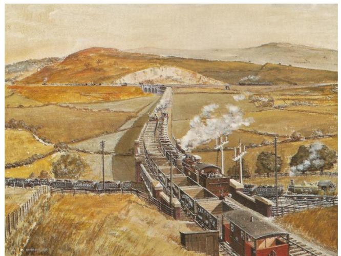
Zuid Wales had een van de dichtste spoorwegnetten ter wereld. Er is weinig van over.